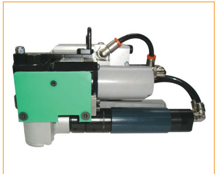
Plastic Foot Cover Poli - Cod. 280.819.100