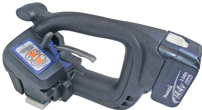
CHART OF TYPES