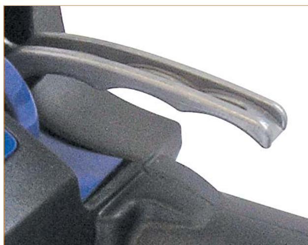
Ergonomic handle - New sealing and opening lever